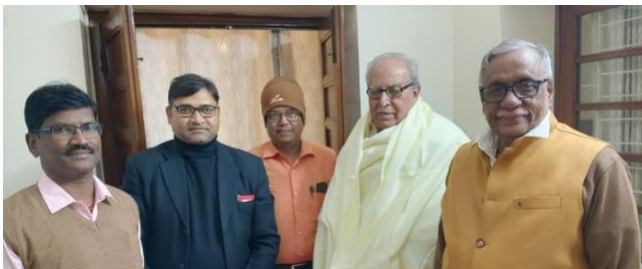
Team IRTSA with Sri.M.Shanmugam, MP