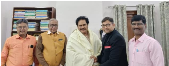
Team IRTSA with Sri.S.Thirunavukkarasar, MP