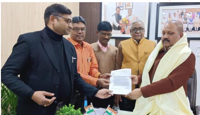
Team IRTSA with Sri.Pradeep Kumar Singh, MP