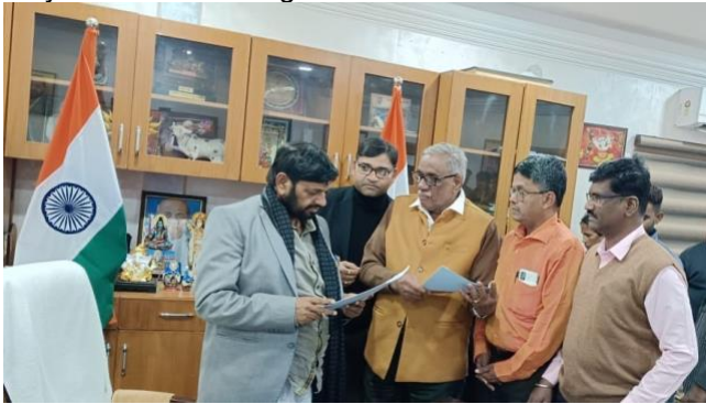
Team IRTSA with Sri.Kaushal Kishore Minister of State for Urban Affairs

2) Creation of posts of SSE in level-8 in Integral Coach Factory for manufacturing "Vande Bharat" train sets.